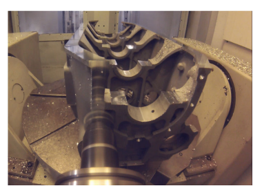
5 axis machining

Concerning crankcases, VINT'AIR can perform the high precision line boring in its own classical engine machining shop. This can include main and rod bearings boring.