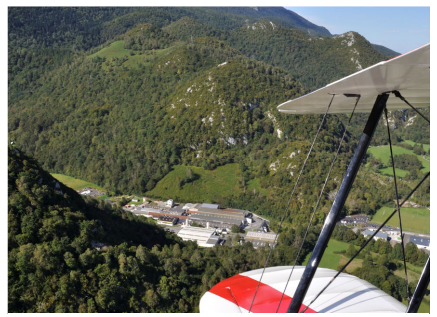
Ventana Arudy (Foundry plant)

Through a close cooperation with the VENTANA aerospace company, we can now offer a global manufacturing solution